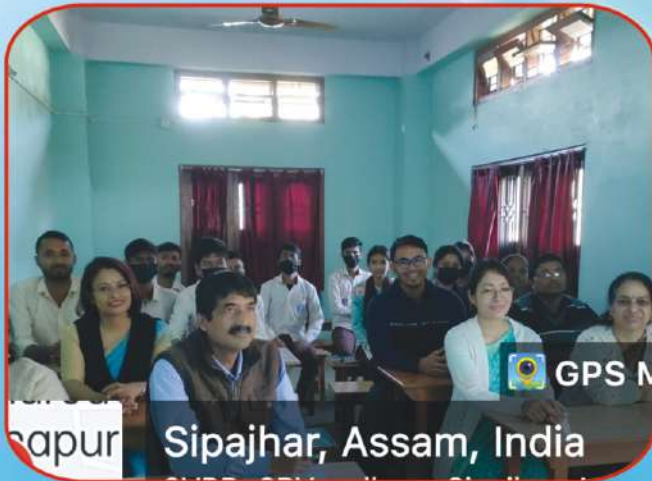
Sonapur Sipajhar, Assam, India