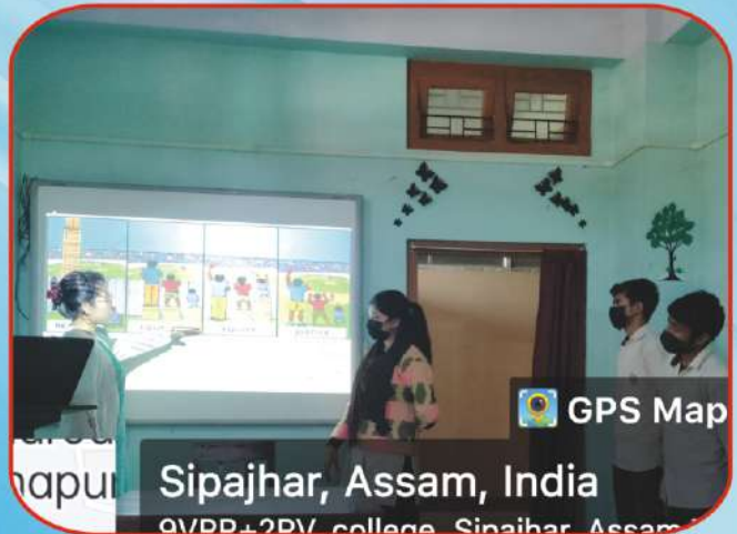
Sonapur Sipajhar, Assam, India 9VRR+2PV college, Sipajhar, Assam