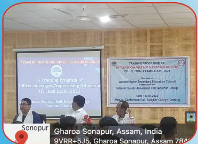
Sonapur Gharoa Sonapur, Assam, India 9VRR+5J5, Gharoa Sonapur, Assam 784